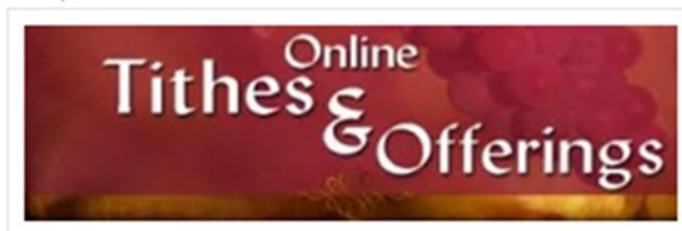
(Button on the Website which takes you Directly to Online Giving)