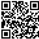
For Mobile Giving