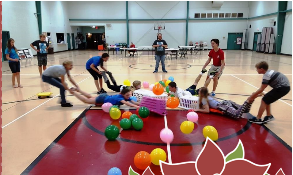
Sunday Night Youth Fun