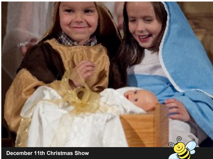
December 11th Christmas Show