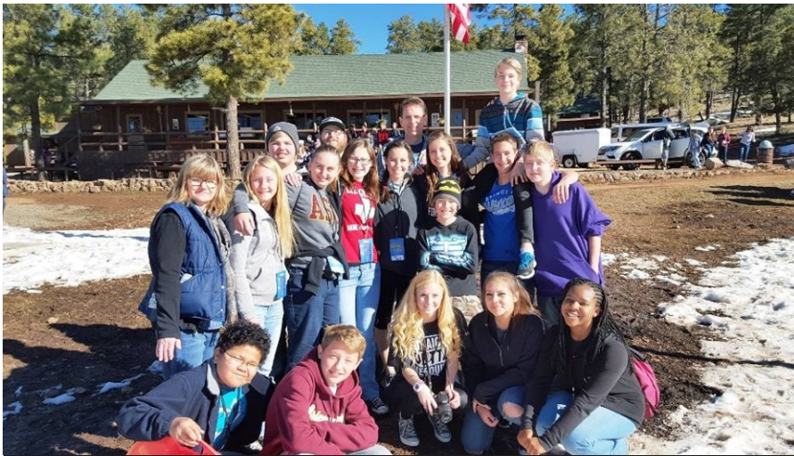
Winter Camp 2016