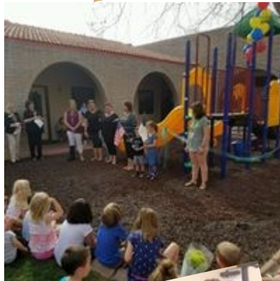
Dedication of New Preschool Playground