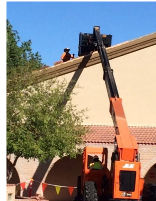
New Roof Tiles