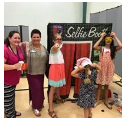
Children's Ministry Selfie Booth & Vacation Bible School