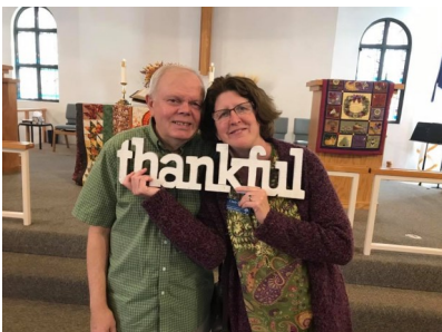
Thanksgiving Day Service