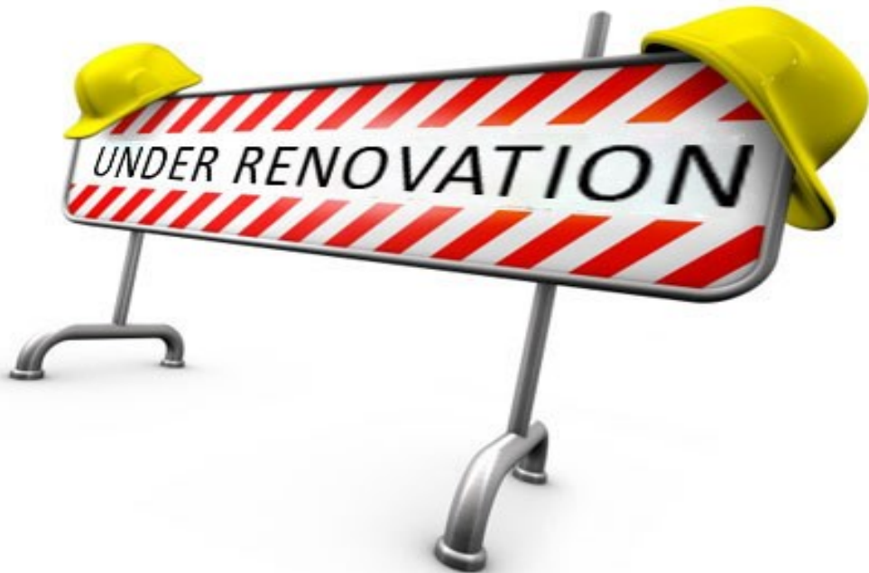
The Narex and Narex Bathrooms are under construction now!