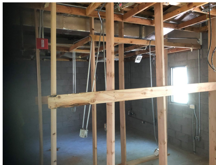
Cleared, demo and start of Reno!