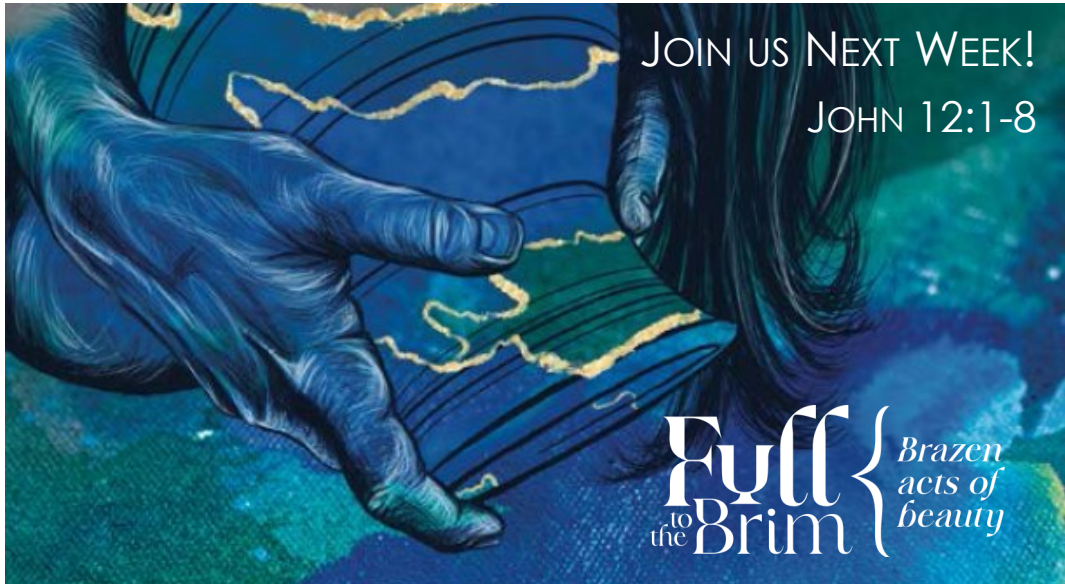
Artwork and Liturgy from "Full to the Brim" Lent series

Thank you for joining our services today!